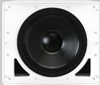
Onyx 207 XTW 7" Outdoor Coaxial Speaker - IP 67