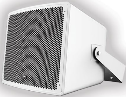
Onyx 210 XTW 10" Outdoor Coaxial Speaker - IP 67